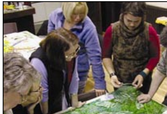
Figure 1: Using an aerial photograph of Moston Vale in workshop

In the initial stages of planning for Moston Vale, participants were dubious about looking at the assets of the area. The workshop started very slowly. Several techniques were used to stimulate discussion, and by the end of the workshop 80 assets had emerged. Project officers and community members discussed the area. At the end of the evening community members said they had remembered more and learned more about their area than they thought possible.