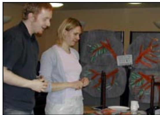
Figure 3: Participants working on the Integrated Decision-making stage of DesignWays

order to achieve the ambitious goals set by the Directive, changes will be necessary not only in the water sector, but also in urban planning, industrial design, architecture, agriculture, infrastructure planning and landscape management. This will require an innovative approach to planning. The ambitious nature of the goals also implies the need to engage the participation of many stakeholders early in the planning process. Active involvement of stakeholders in developing options and plans on this scale is still uncommon.