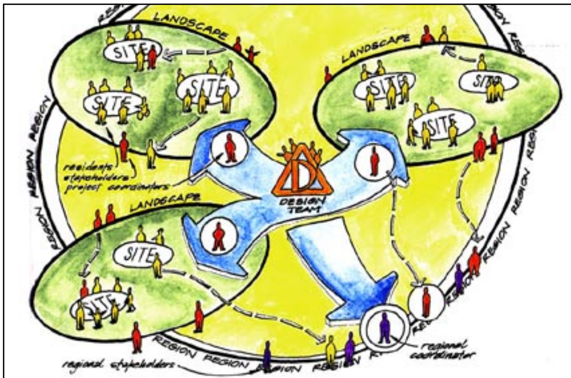
Figure4: Mechanism for added-value planning to link site, landscape & regional levels of scale.